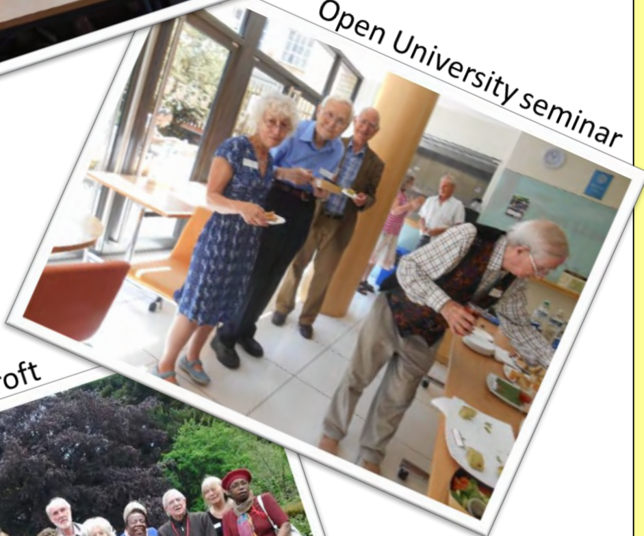
Open University seminar