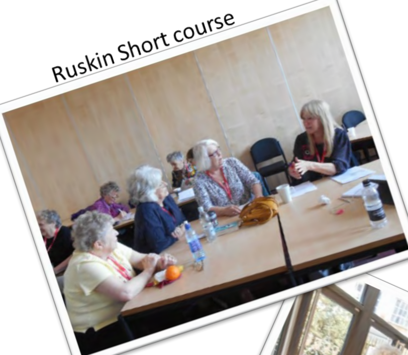
Ruskin Short course